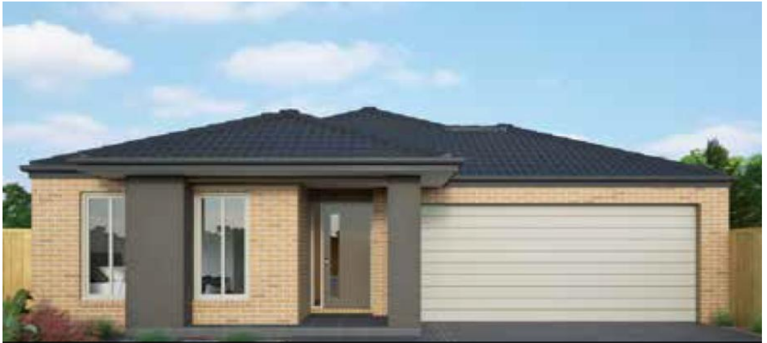
Lot 2504 Giri Way, Werribee