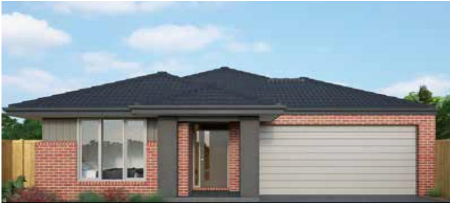
Lot 419 Masters Crescent, Mambourin